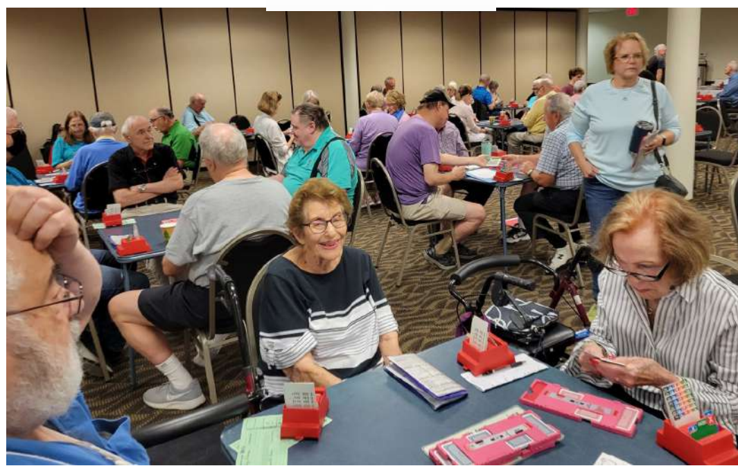
Players enjoying the After-Labor Day Tournament in Northbrook.